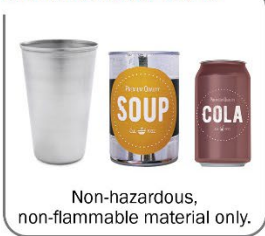
METAL CANS & CUPS

Non-hazardous, non-flammable material only.