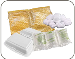
OTHER PLASTIC ITEMS